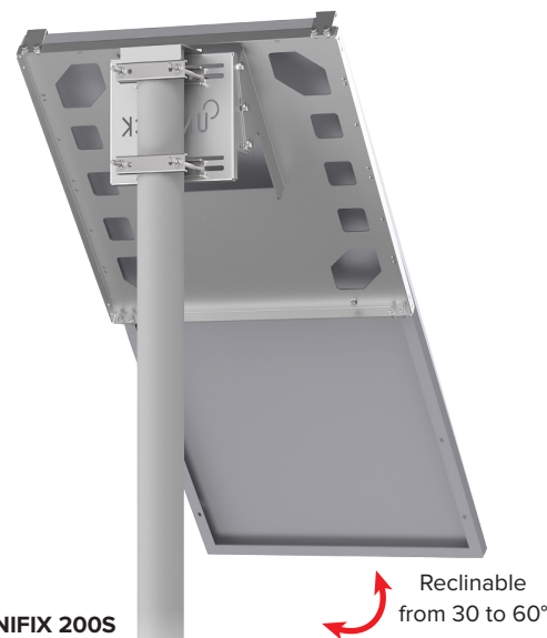
UNIFIX 200S For Unisun 200.24M Landscape or portrait orientation Masthead or middle of the mast Mounting flanges in option Ref 0941