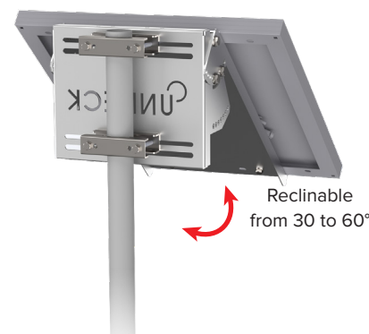
UNIFIX 50S For Unisun 30.12M/ 50.12M/ 50.24M/ 55.12BC Landscape orientation Masthead or middle of the mast Mounting flanges in option Ref 0293