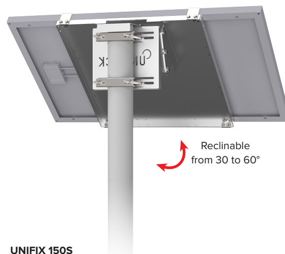
UNIFIX 150S For Unisun 150.12M/ 150.24M/ 150.12BC/ 200.12BC Landscape or portrait orientation Masthead or middle of the mast Mounting flanges in option Ref 0866