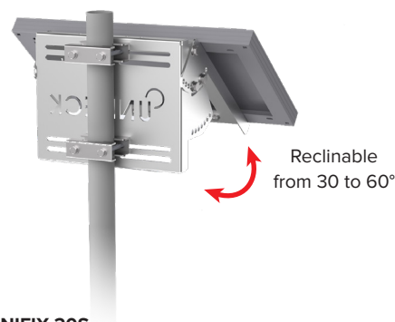
UNIFIX 20S For Unisun 10.12M/ 10.24M/ 20.12M/ 20.24M Landscape orientation Masthead or middle of the mast Mounting flanges in option Ref 0286