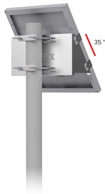
UNIFIX 50SF For Unisun 30.12M/ 50.12M/ 50.24M/ 55.12BC Portrait orientation Masthead and middle of the mast Mounting flanges in option Ref 0064