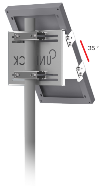
UNIFIX 20SF For Unisun 10.12M/ 10.24M/ 20.12M/ 20.24M Portrait orientation Masthead and middle of the mast Mounting flanges in option Ref 1139