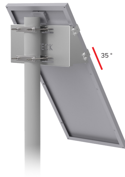
UNIFIX 100SF For Unisun 80.12M/ 100.12M/ 100.24M/ 120.12BC Portrait orientation Masthead Mounting flanges in option Ref 1146