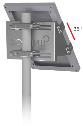
UNIFIX 5SF For Unisun 5.12 M Portrait orientation Masthead and middle of the mast Mounting flanges in option Ref 2693